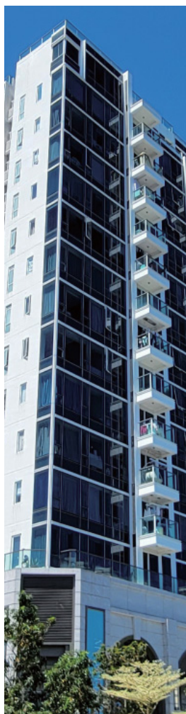
私人住宅 Private Domestic