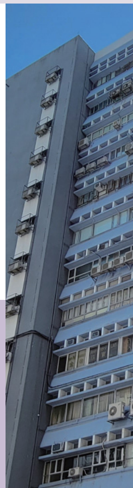
私人工業樓宇 Private Industrial