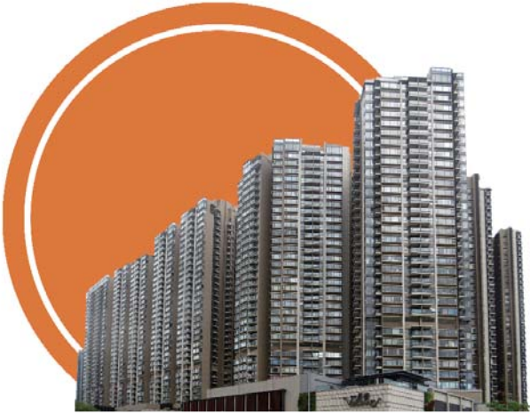
私人住宅 Private Domestic