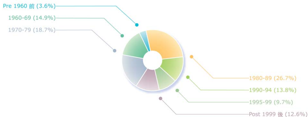
按樓齡分類的總存量 Stock Distribution by Age

2004年落成的單位共有23 460個，主要位於九龍及新界，分別佔落成量的42%和48%。以地區計，九龍城、元朗和油尖旺的供應量最多。單是B類單位已佔此分類落成量78%，如以整體新落成量計，則為70%。