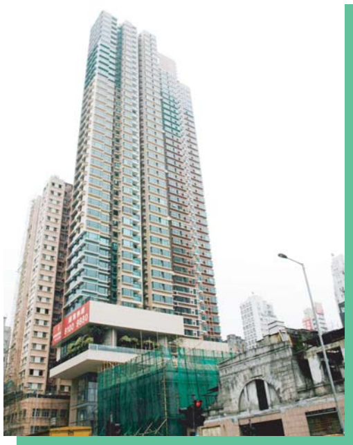
售價及租金指數 Price and Rental Indices

The provisional price index for the fourth quarter 2004 surged 28% from a year earlier, while rents lagged behind, registering a milder increase of 10%. Prices climbed up substantially at the beginning of the year, consolidated in mid-year and rose again at the year-end. Rents recorded modest increase throughout the year.