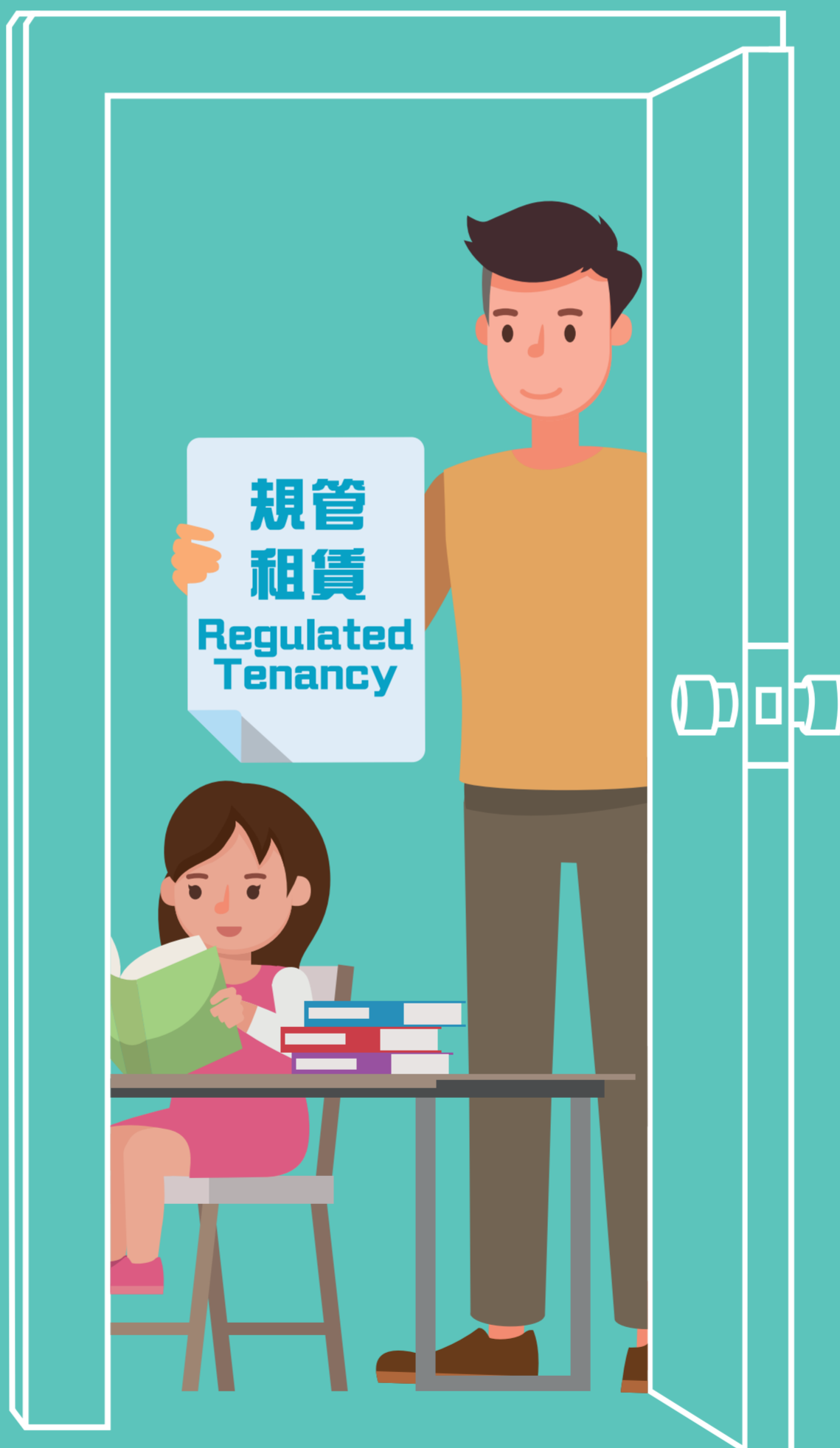
Room 2 號房