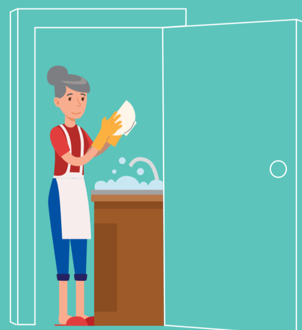
Room 3 號房

口頭租賃 亦受規管 Oral tenancies are also regulated